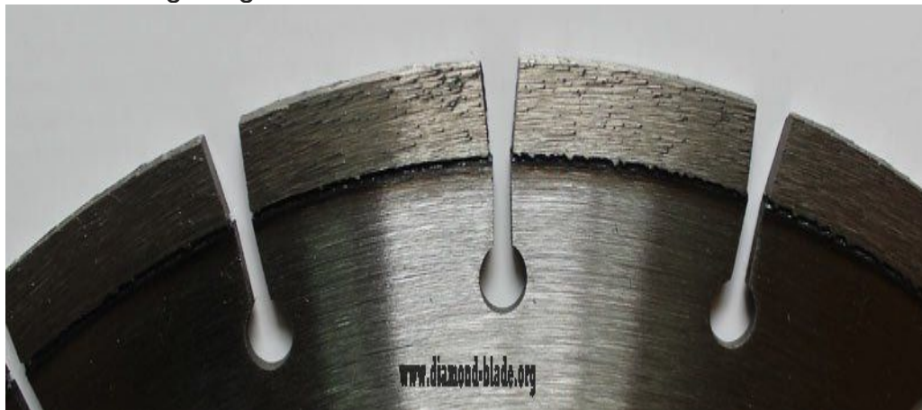
Laser welded diamond blades